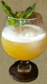
MOTHER OF WATER